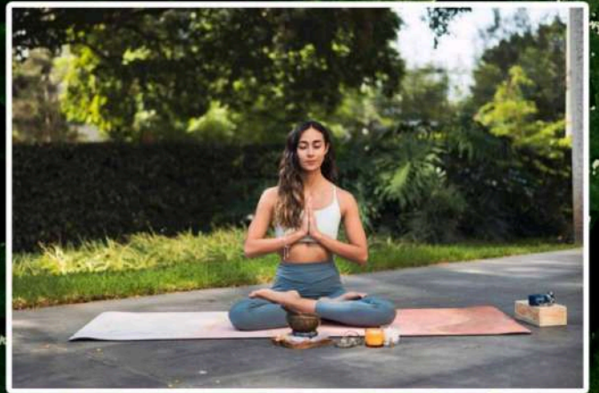
Find your inner peace amidst the serene environs