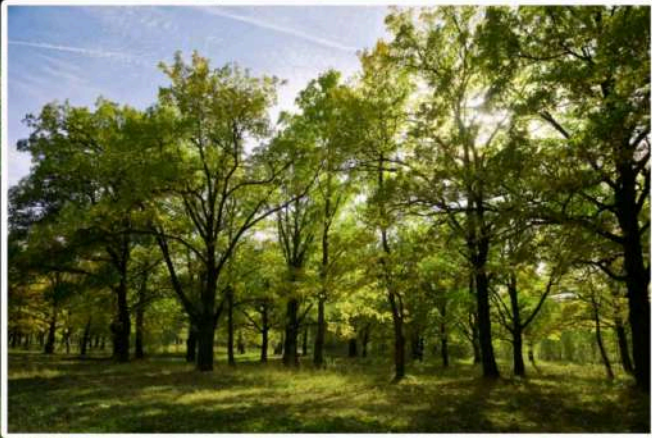
Earn Income from sandalwood Harvested