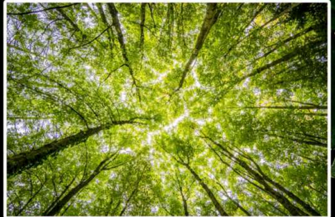
Contribute to a carbon positive world by supporting sustainable practices.