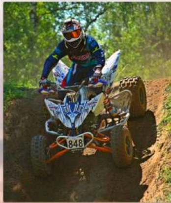
ATV bike ride