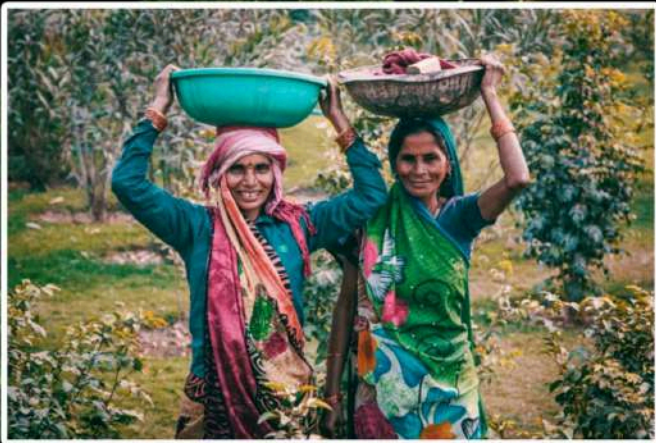
Support and encourage local economies and help create job opportunities